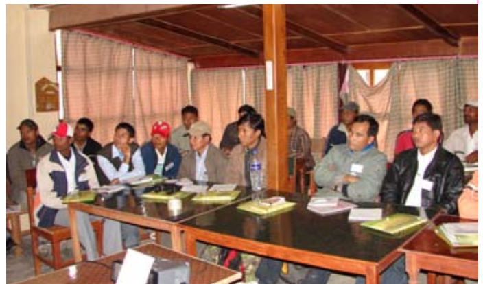
National workshop to discuss wetland conservation issues

Work on making a visitor centre is underway. A number of bird illustrations has been completed. For other animals we will borrow some paintings and use photographs so that we have enough materials for designing the visitor centre. On the site, we are looking for possibilities of changing an incomplete cemented structure into the visitor centre. A permission for this is needed from the Department of Irrigation.