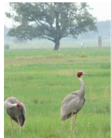
Pair of Sarus Crane

BirdLife International has identified Jagdishpur as an Important Bird Area (IBA) because of its international importance for threatened species and their habitat conservation. BCN has been carrying out bird surveys in the area for a long time. The reservoir is surrounded by smaller lakes (e.g. Sagarhawa and Niglihawa) serving as a buffer zone for bird movements of nearly 150 recorded species but many more species are likely to occur. The site provides an important habitat for resident, wintering and passage migrant, wetland and