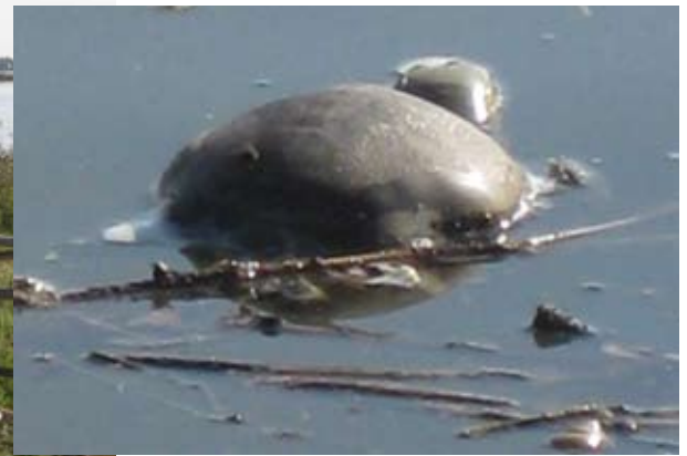
Dead tortoise within the lake area

Fish farming in the lake has posed problems to ecosystem health