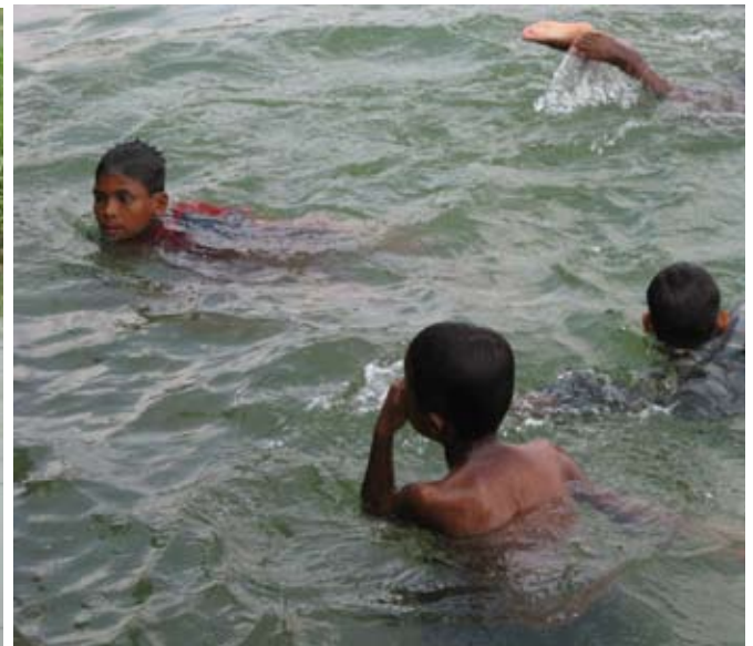
Children enjoying bathing in the lake

The site is owned by the state. The surrounding areas are privately owned. An estimated 1000 families live in the Niglihawa Village Development Committee (VDC), and Jadishpur lake is part of the VDC. Nearly 2000 people live in the immediate vicinity of the lake within 500m radius. The majority of people living in the area are from Tharu, Yadav and Muslim communities. There are also hill tribes eg Brahmin, Chhetris, Gurungs, Magars and others. Most villagers that live in the adjacent area are farmers and are poor.