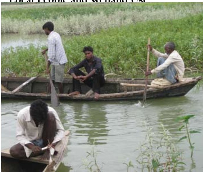
Fishermen in the lake