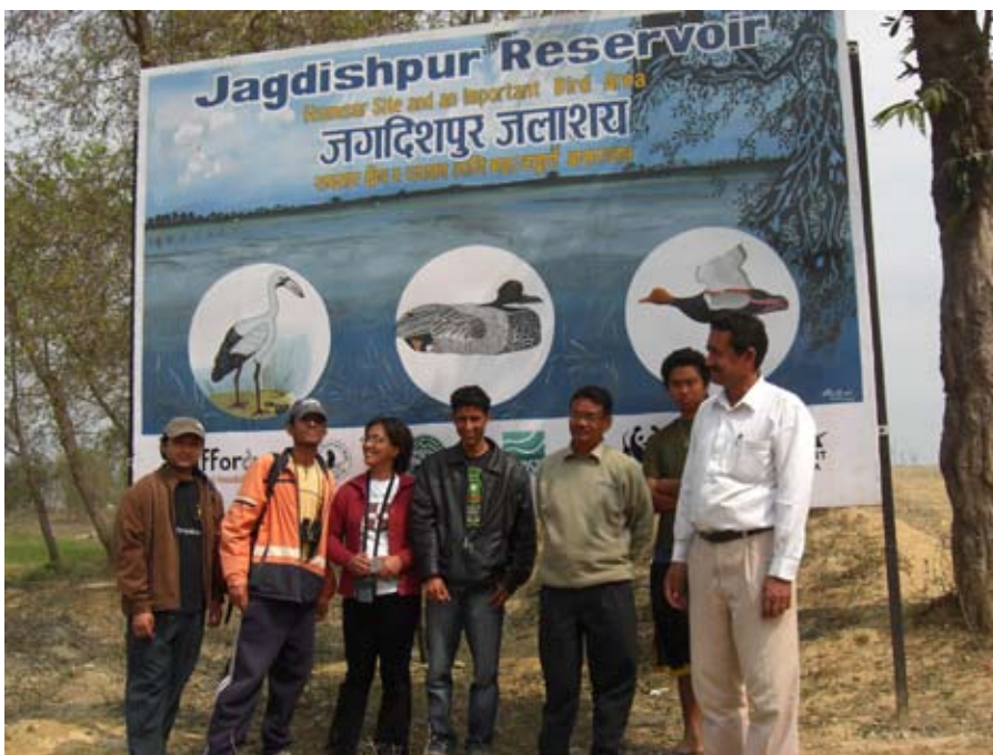
Ramsar, DNPWC, Local NGO and BCN staff

capacity of SSG to safeguard the sites, it is effective and economical. After all conservation of any site is best done by the locals living in the area.