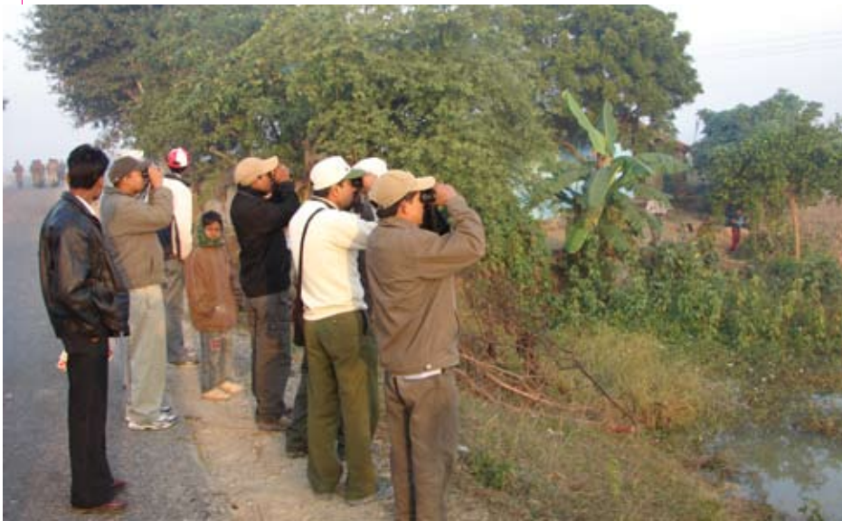
Bird watching in the lake area

Recently, local photo journalists are sending