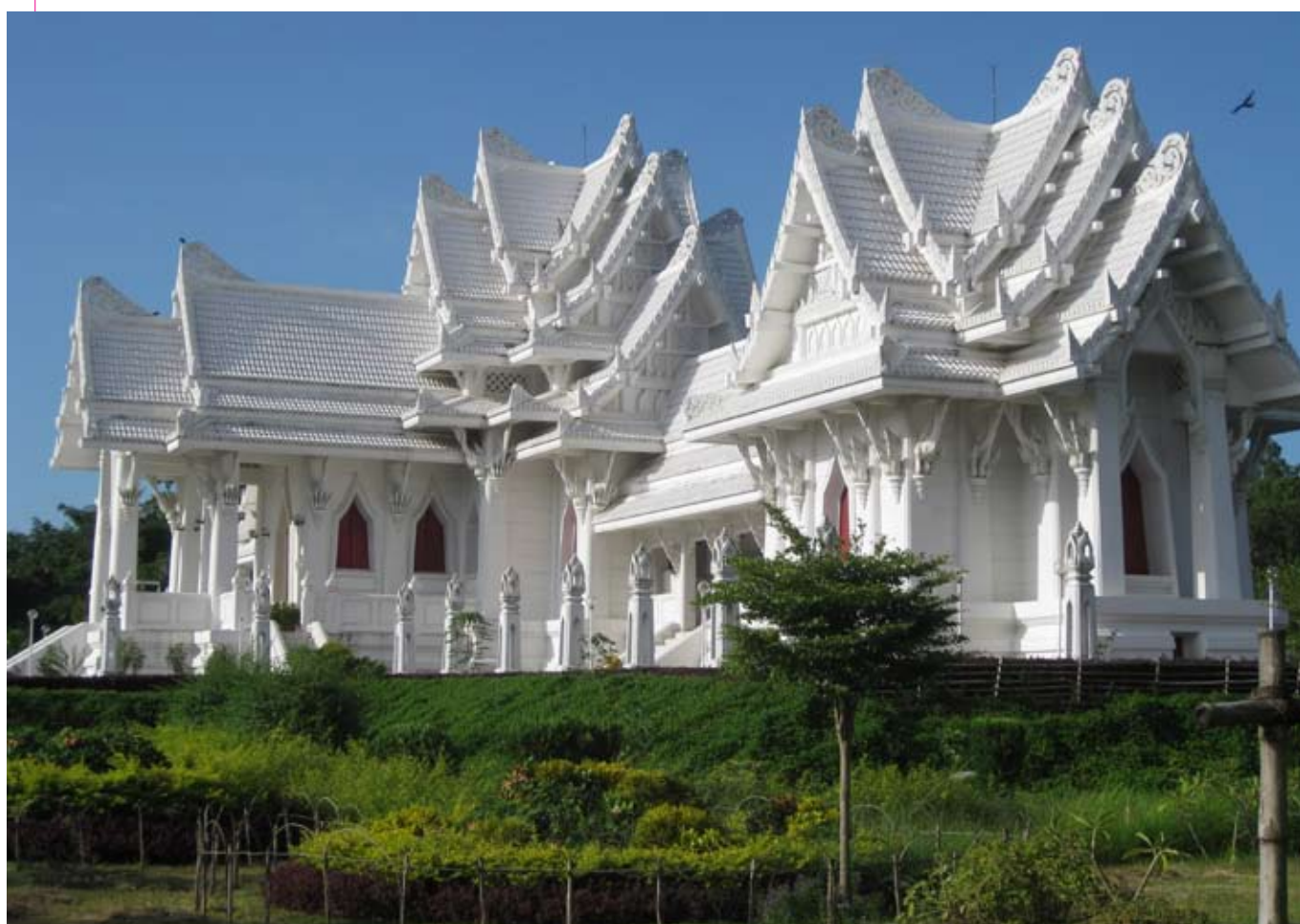
Kudan, more than 2000 years old Buddhist monastery (top left), Peace Pagoda (top right), and Thai Buddhist Temple in Lumbini (above)