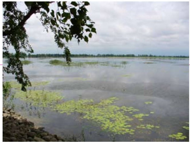
Google image of the lake with Banganga River and forest patch on its west, and a site photo of the Lake

The wetland area was declared a Ramsar Site in 2003 mainly on the basis of migratory waterbirds and threatened mammals found in the area.